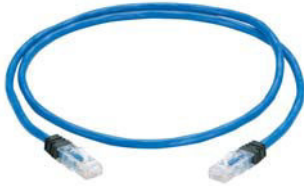
Plug to Plug Shielded Cable Assembly