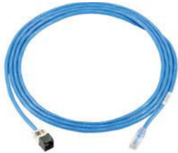
Jack to Plug UTP Cable Assembly