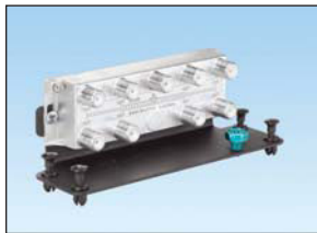
MS8S1G and MS8S2G