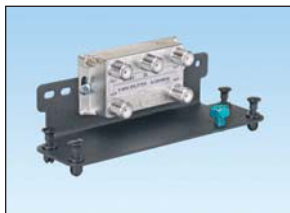
MS4S1G and MS4S2G